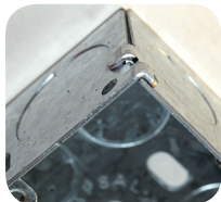
Knockouts of two sizes