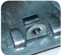
Adjustable installation lugs